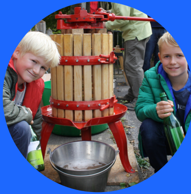
APPLE DAY SEPTEMBER