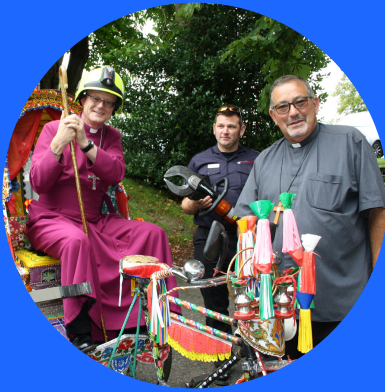
CHURCH FETE JULY